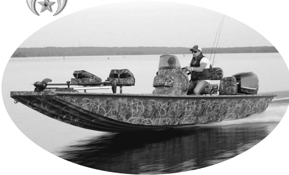
WAREAGLE 961 BH